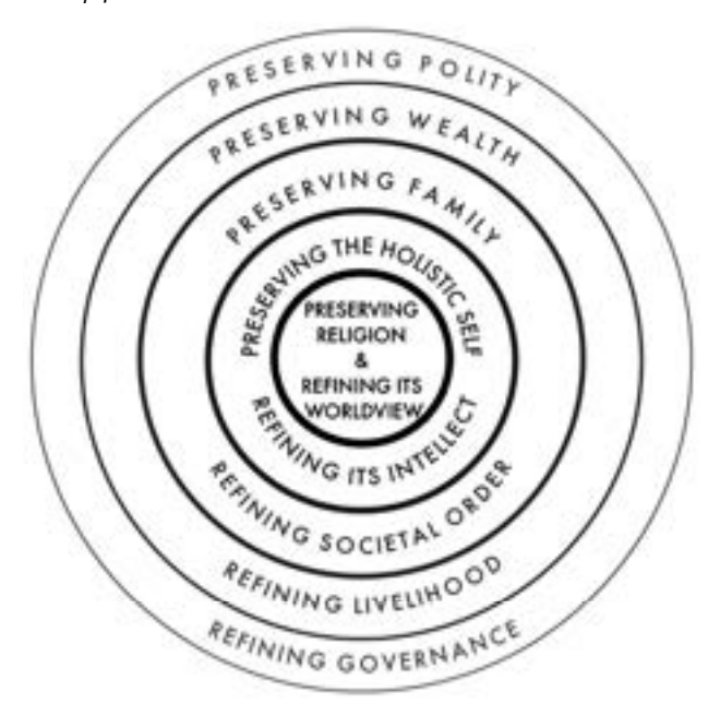
Diagram: The five magāṣid realms²

Finally, I made a commitment to be brief, as my primary aim was to highlight certain general and concise guidelines. Those who should be most concerned with learning about the 'umrānī maqāṣid are the educated Muslim masses and those working in the fields of politics, economics, and sociology.