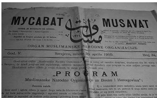
Musavat party newspaper of the first political party, the MNO (Muslim People's Organization) in Cyrillic, Arabic and Latin letters. Gazi Husrev-bey Library