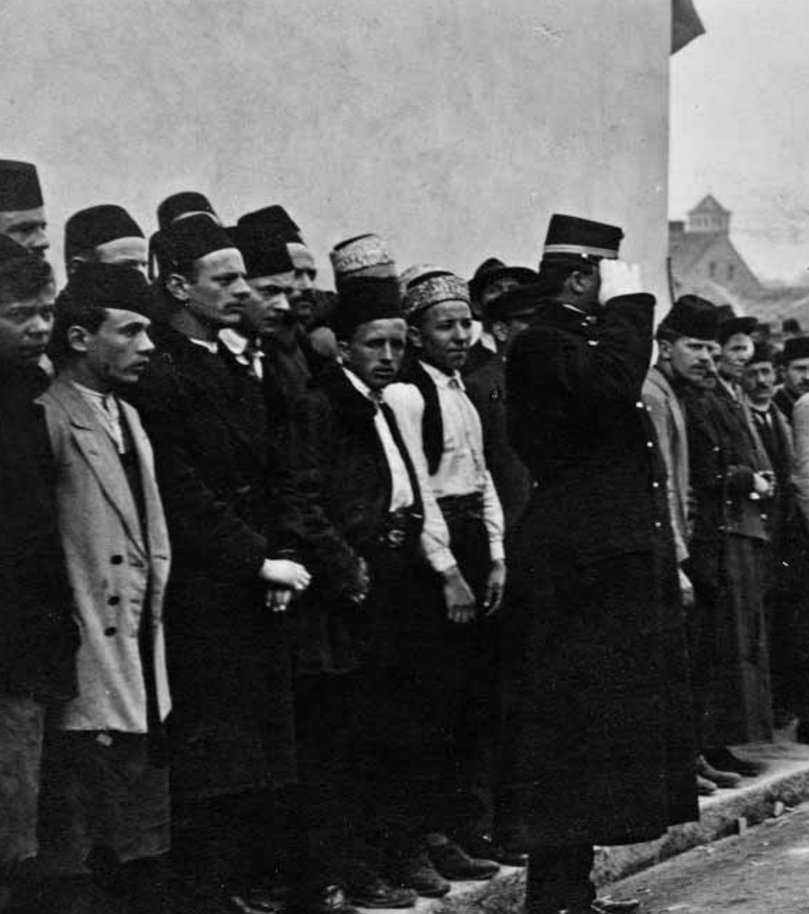
Photo of the Reis ul-Ulema Mehmed Džemaludin Čaušević and Oskar Potiorek. On the occasion of the nomination of Džemaluddin Čaušević as Reis ul-Ulema, the head of the Islamic Community in Bosnia in Sarajevo on 26 March 1914. Čaušević is in company of Oskar Potiorek who ruled over Bosnia from 1912-1914, and members of the Ulama majlis. They are walking towards the Emperor's mosque (Careva džamija) where Čaušević will receive the official document ( menšura) that confirms his position as Reis ul-Ulema.