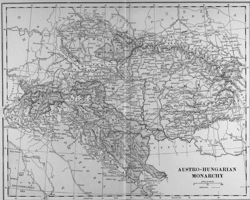
Below: Map of the Austro-Hungarian Empire 1894 showcasing Bosnia