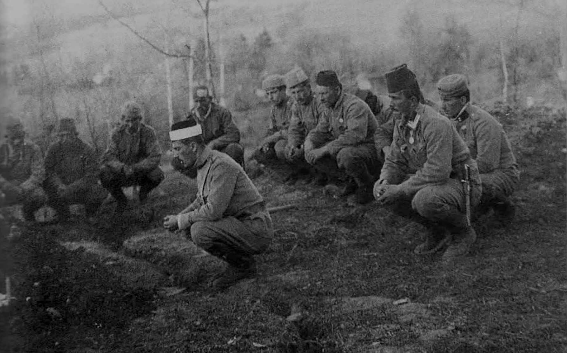
Above: Military Imam in the Austro-Hungarian Army