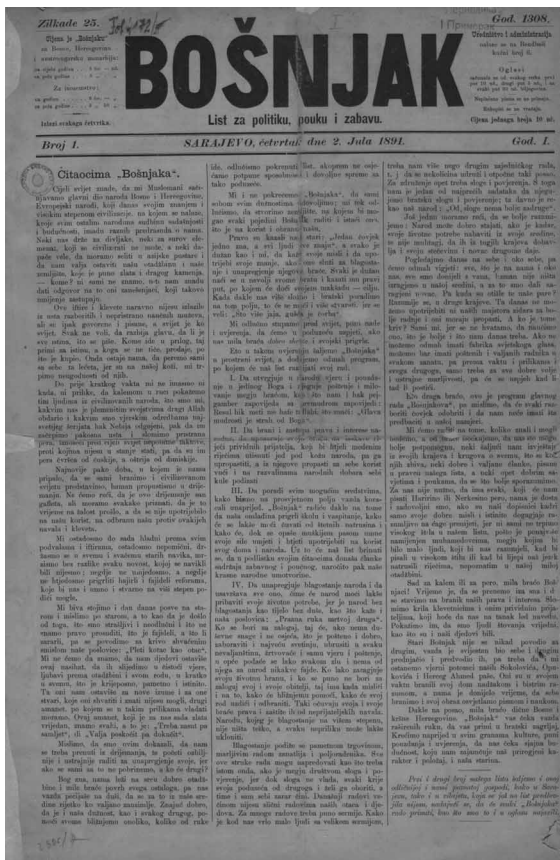
Example of a title page from the journal Bošnjak (2 July 1891). Gazi Husrev-bey Library