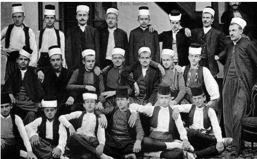
Students of a Medresa during the Austro-Hungarian period. Photo taken in the beginning of the 20 th century. On the top its says in German language Turkish students. These were not Turkish but Bonsiak students. “Turkish” stood for “Muslim.”